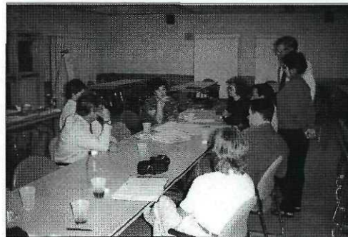
Public participation provides the foundation for the Southeast Chandler Area Plan.

The conversion from agricultural uses and rural lifestyles does not come easy. Suffice it to say, it is a difficult and often painful process for all involved. Fortunately, the City of Chandler General Plan Land Use Element establishes the parameters of the development character and quality of life envisioned by the community for Southeast Chandler. To more fully define a vision for the area, an intensive public outreach process was developed to maximize the input received from the community. Equally important, was the need to develop a public involvement process that did not restrict the free flow of ideas and public expectations — it was important that all involved had opportunities to not only be heard, but to be listened to.