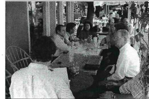
Sharing observations from an afternoon field outing in Southeast Chandler.

Force to survey the overall conditions of the entire Southeast area.