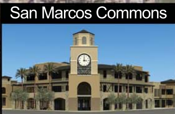
San Marcos Commons

Sites 1,2,3 - San Marcos Commons - Phase I, 79 Townhomes, 50% complete - Mixed-use development - 152,000 SF of retail, office & restaurant space - Multi-level parking garage (450 spaces)