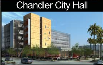
Chandler City Hall

Chandler City Hall - Approximately $70 million investment - 5 story tower with campus setting - museum to be incorporated with the site - 125,000 SF of space and parking for 600 vehicles - Completion expected in 2010