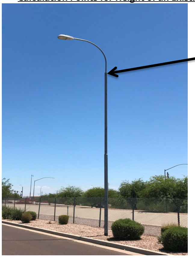
Exhibit A2 <u>Calculation Points for Height of an Existing Streetlight with Integrated Luminaire Mast Arm</u>

The "Connection Point" on an Existing Telescopic Style Streetlight Pole with an Integrated Luminaire Mast Arm