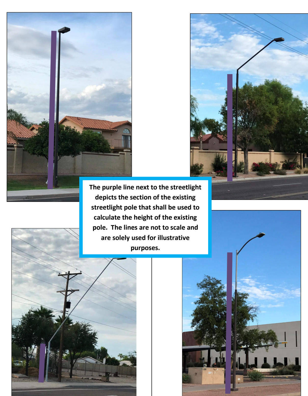
Exhibit A1 <u>Calculation Points for Height of an Existing Streetlight with Separate Luminaire Mast Arm</u>

Mailing Address Mail Stop 405 PO Box 4008 Chandler, Arizona 85244-4008