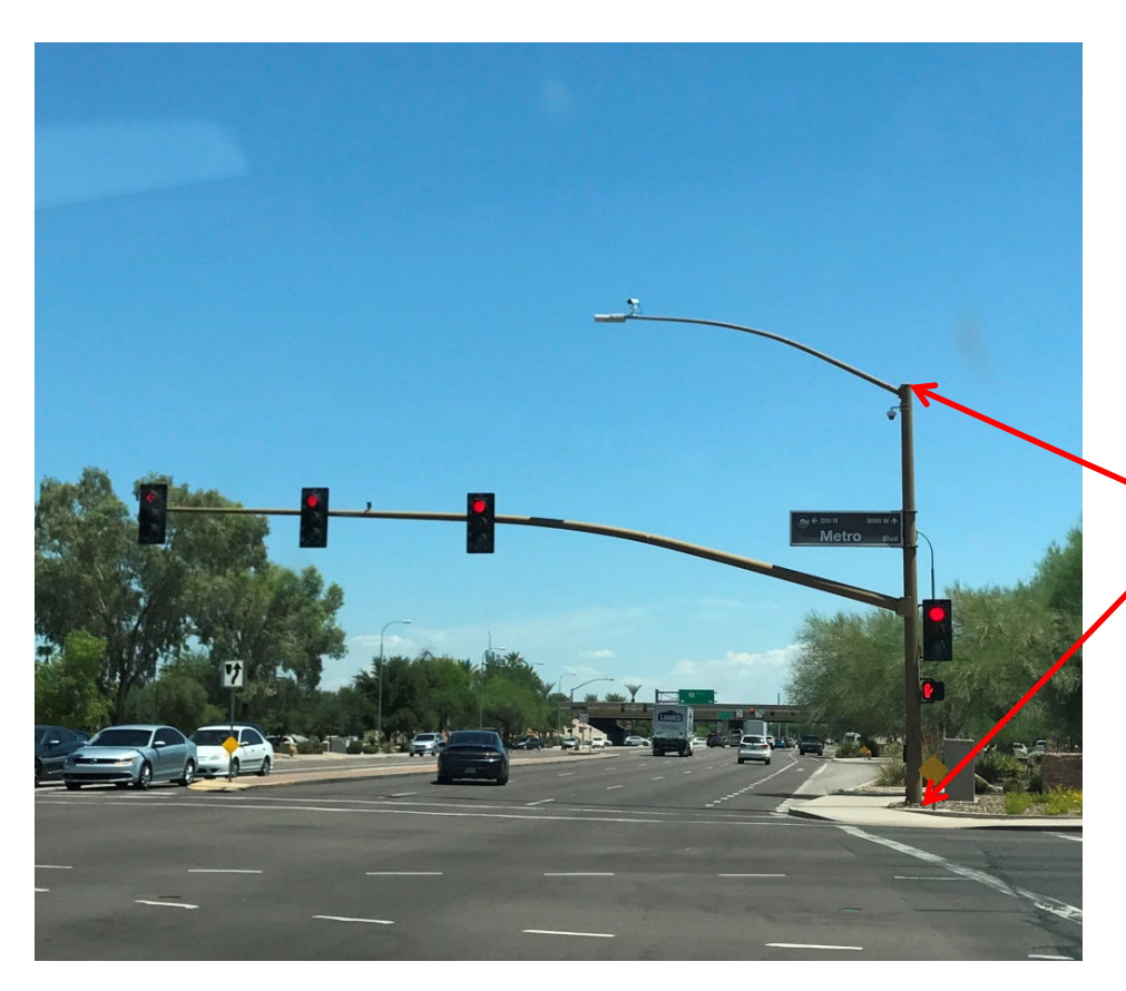
Exhibit B Calculation Points for Height of Existing Traffic Signal Pole

The Top and Bottom Points on a Traffic Signal Pole to Calculate the Base Vertical Height of the Existing Pole