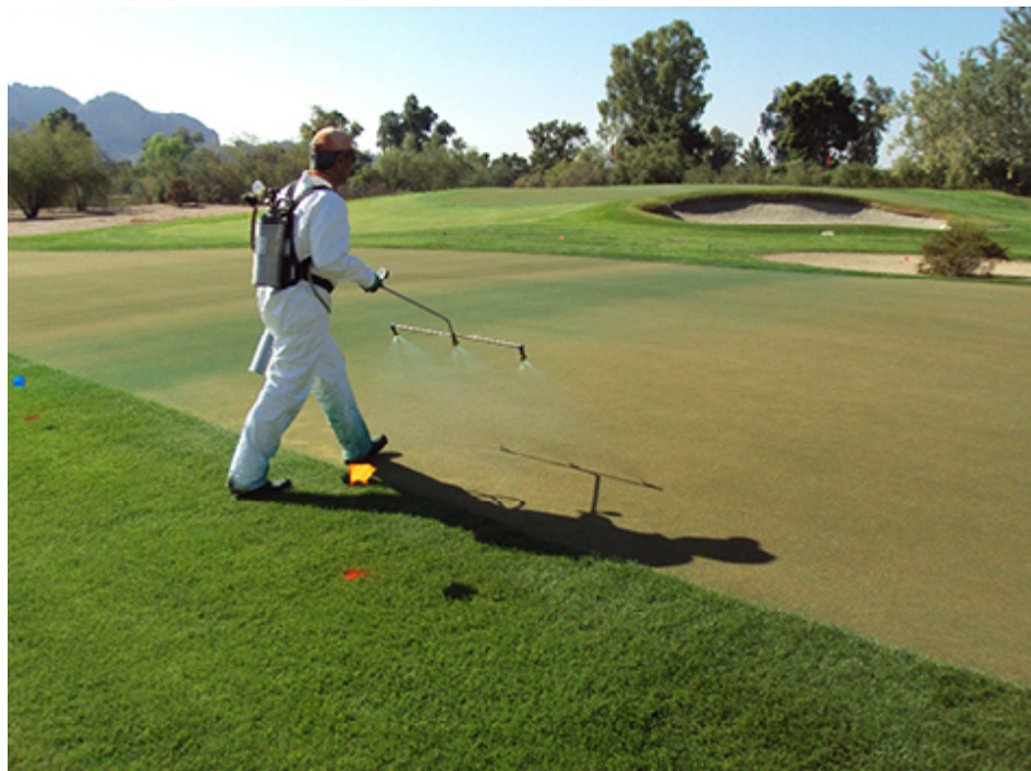
Colorants were applied using a CO 2 -powered backpack sprayer with a hand-held three-nozzle boom with TwinJet™ 8008 flat fan nozzles spaced 20 inches apart.