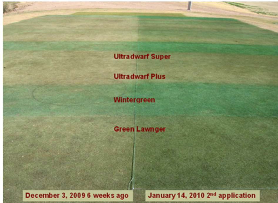
Colorants applied Dec. 3, 2009, faded after six weeks. When reapplied, less product was required to achieve the desired result.

Although research on colorants has been performed in the Southeast (1,3,5,6), very little work has been done to evaluate colorant use in the desert Southwest, where the bermudagrass dormancy period is typically shorter