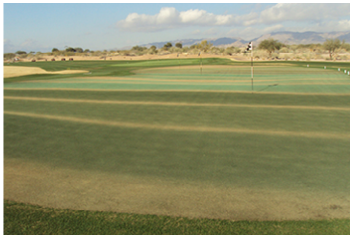
In mid-November when the colorants were first applied, the TifEagle bermudagrass green at the Whirlwind Golf Club site retained its natural green color.