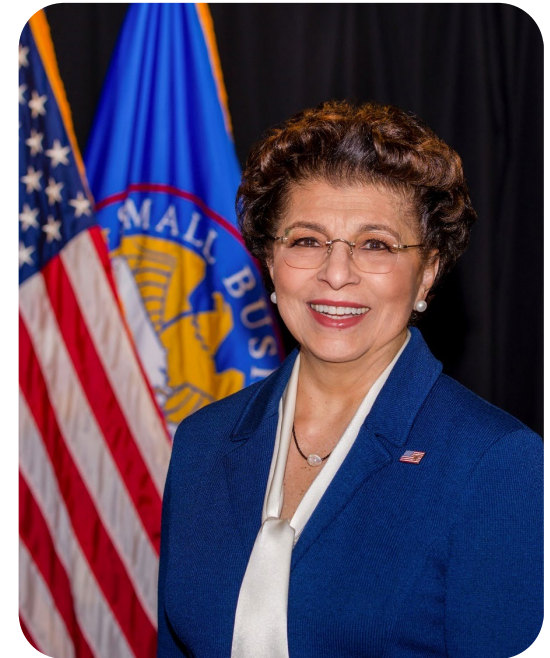
Administrator Jovita Carranza

Upon a request received from a state's or territory's Governor, SBA will issue under its own authority, as provide by the Coronavirus Preparedness and Response Supplement Appropriations Act that was recently signed by the President, an Economic Injury Disaster Loan declaration.