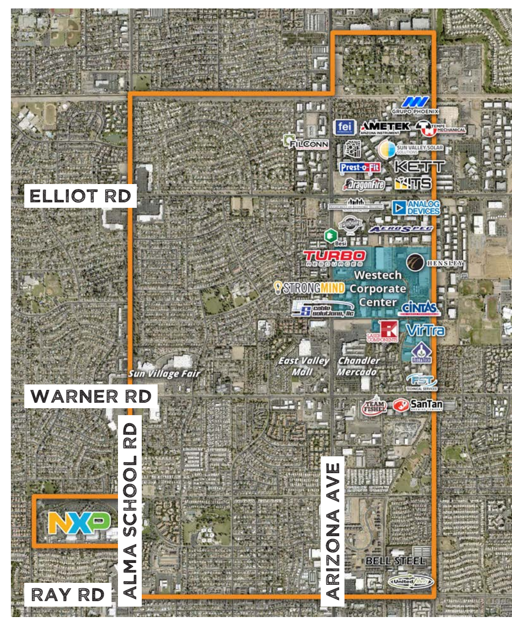
DATA SOURCE: City of Chandler Economic Development Division