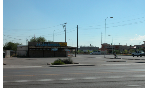
Northeast corner of Pecos Road and S. Arizona Avenue

Taking advantage of the new Santan Freeway access will involve time and effort. The keys to new development are planning the Corridor's changing land uses, streets and other public investments in a strategic way and implementing a series of actions targeting developers who will provide the essential investment in the future.