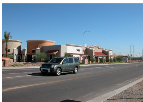
New Development South of the 202 Freeway