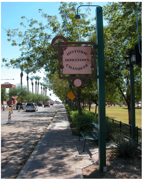
Downtown Chandler Gateway