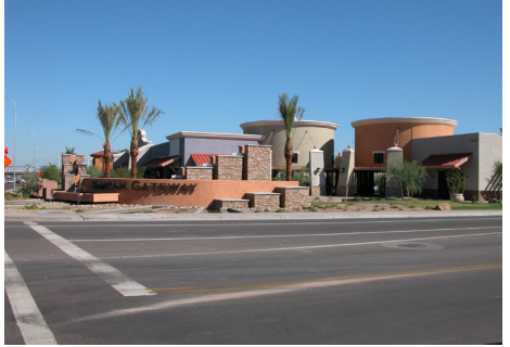
Santan Freeway Development

At this time the Corridor resembles a barbell, with the Downtown at the north end and the freeway exit and centers at the south end. The South Arizona Avenue Corridor lies between these two. It will be heavily influenced by the new shopping centers and the new pattern of access to and from the freeway on the south, and the new public investments in courts and City Hall at the north end. The recommendations of the study are to include recommendations for Downtown's revitalization as well as the Corridor. The two areas are integrally related.